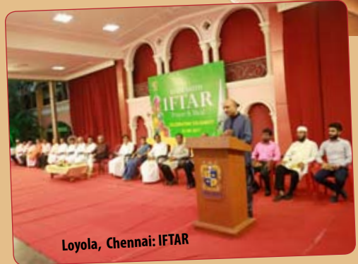
Loyola, Chennai: IFTAR

The U.S. Embassy, New Delhi has awarded ICRDCE , Chennai one more English Access Microscholarship program. to be conducted at St. Joseph's College for