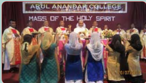
ARUL ANANDAR COLLEGE MASS OF THE HOLY SPIRIT