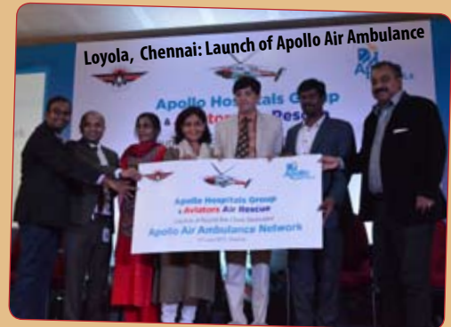
Loyola, Chennai: Launch of Apollo Air Ambulance