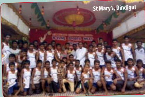
St Mary's, Dindigul