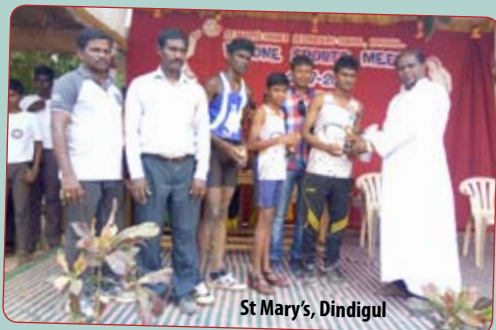
St Mary's, Dindigul