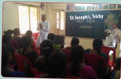
St Joseph's, Trichy