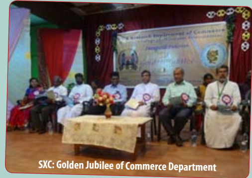
SXC: Golden Jubilee of Commerce Department