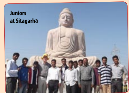
Juniors at Sitagarha